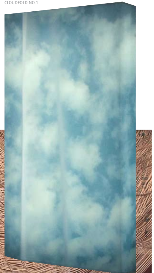
CATHRYN MONRO CLOUDFOLD NO.1