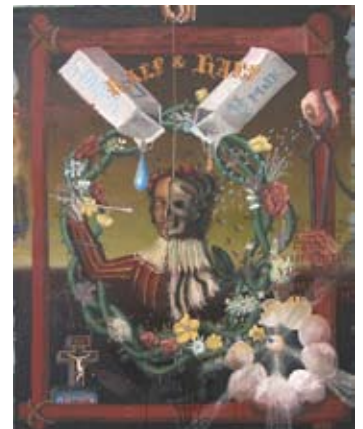
MATTHEW COUPER CALCIUM DEFICIENCY

http://www.artgallery.org.nz/index.php/ps_pagename/exhibition/exhibit/83