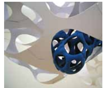
SUSPENDED FIELD 2009. LASER-CUT POLYPROPYLENE AND FOAM-BOUNDED FABRIC HAND- STITCHED OVER METAL

More information on The Suter's website: http://www.thesuter.org.nz/whatson.aspx